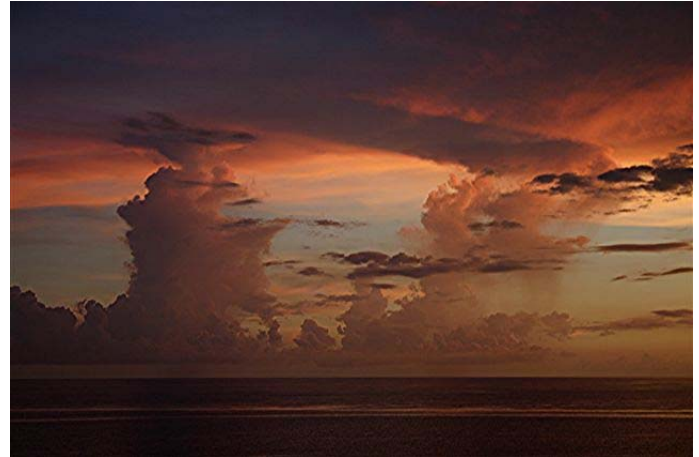
Dusk Sky View