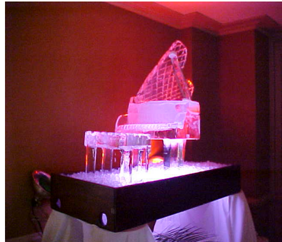
Ice Sculpture at the New Year Brunch Party

Watch your email and the mailroom bulletin board for upcoming socials we are working on. We hope to have a mixer party here shortly.