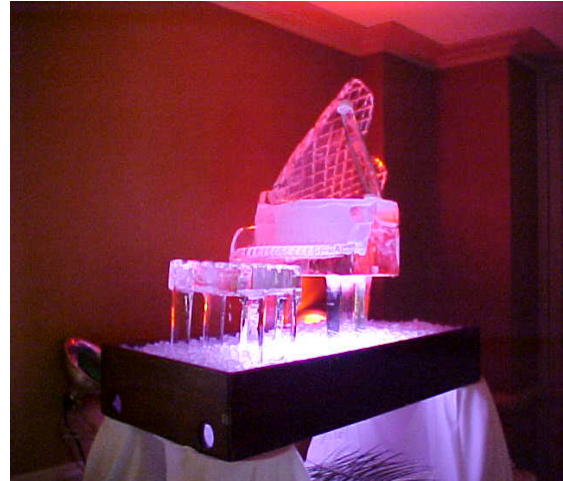
Ice Sculpture at the New Year Brunch Party

Watch your email and the mailroom bulletin board for upcoming socials we are working on. We hope to have a mixer party here shortly.